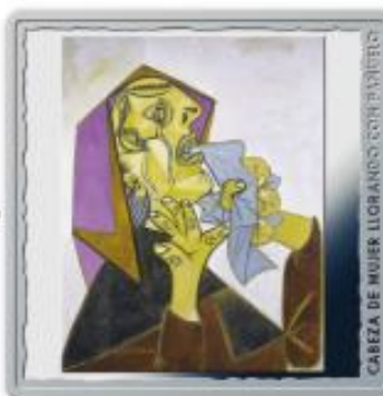
M.N.C.A REINA SOFÍA