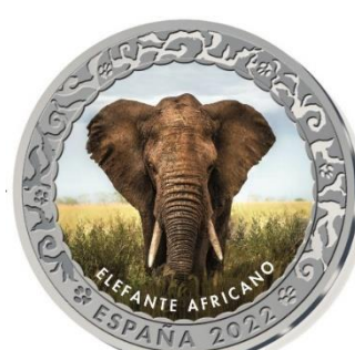
African Bush elephant.