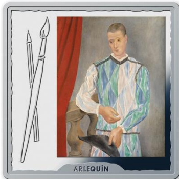
M.PICASSO - BARCELONA