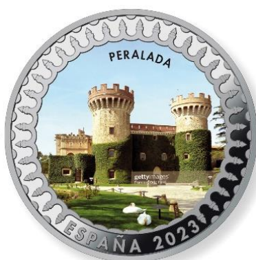
Peralada - Gerona. XIV Century Castle