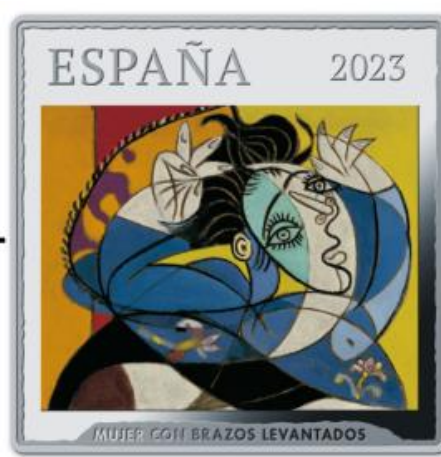
M.PICASSO - MÁLAGA