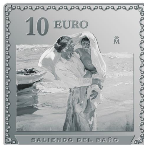
After Bathing Oil on Canvas - 1915

This canvas, painted in Valencia, shows a woman drying off a naked boy, who she wraps in a stunning white cloth. The intense midday sun falls vertically on the cloth, filling the painting with light; one of the hallmarks of Sorolla's style was precisely his ability to tackle the blinding light of the Mediterranean summer. This simple scene and subject matter allowed Sorolla to devote all his attention to the formal execution of the painting.