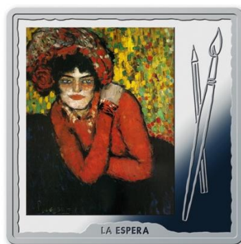
M.PICASSO - BARCELONA