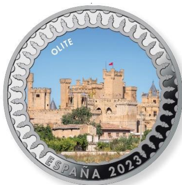
Olite – Navarra. XIV Century Castle