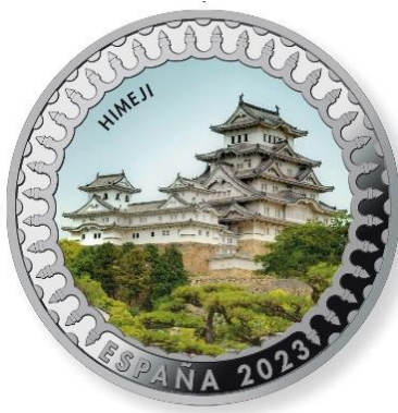
Himeji - Japan. XIV Century Castle