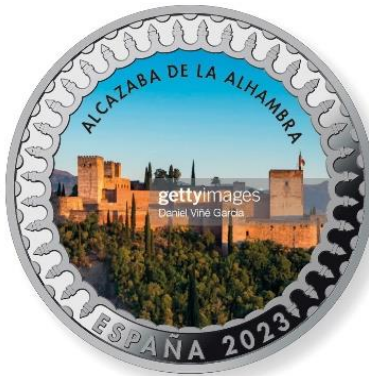
Alcazaba - Granada. XI Century Muslim Fortress.