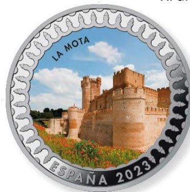
La Mota – Medina del Campo. XIII – XV Century Castle