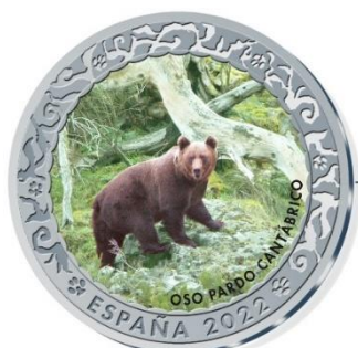
Cantabrian brown bear