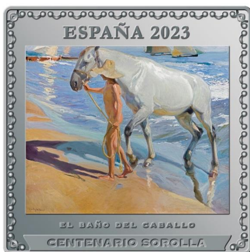
The Horse Bath 1909 Oil on canvas

With its dazzling light, white hues and the beaches of Valencia, it is undoubtedly one of the painter's most significant canvasses and one of Sorolla's most respected and popular works. Sorolla turns this simple daily scene into a monumental painting: a young boy, most likely the son of a fisherman, walks out of the sea, leading the horse that he had taken to the water to cool off. The intense light, the shimmering skin of the horse and the boy, and the reflections of the water on the edge of the sand show the level of mastery and enjoyment that Sorolla had achieved in his painting by 1909, one of the highlights of his career.