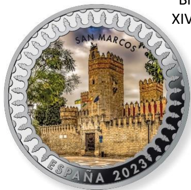
San Marcos - Cadiz. XIII Century. Fortress