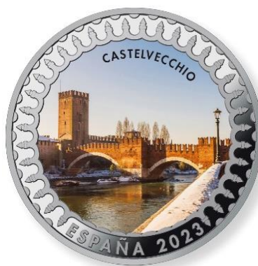
Castelveccchio – Italy. XIV Century Fortress