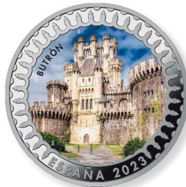
Butron – Bilbao XI and XIX Castle.