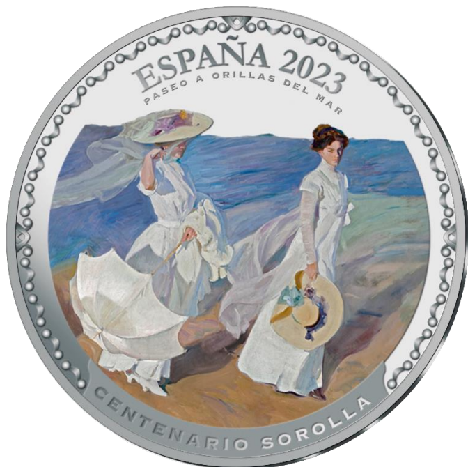
Stroll along the Seashore 1909 - Oil on canvas

This is one of the painter's most representative pieces: a scene depicting an "elegant stroll", as was commonplace on the beaches of the north, transported to the beach in Valencia. The water and beach sand come to life with long brush strokes, providing the backdrop for the figures of his wife and daughter, Maria, who walk dressed in white—Sorolla's famous white—as the breeze ruffles their dresses and headdresses. The photographic framing, which cuts off Clotilde's widebrimmed hat and leaves a strip of empty sand, brings modernity to the work.