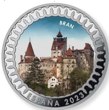
Bran – Romania. XIV Century Castle