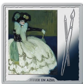
M.N.C.A REINA SOFÍA

Those are the 6 obverses for the 1 Oz. coins (36 x 36). They show some masterpieces of Pablo Picasso in color, "Woman in Blue", "Harlequin", "Bullfight" "Seated Woman Resting on Elbows", "Jaqueline Seated" y "Weeping Woman's Head with Handkerchief".