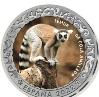
Ring tailed lemur.