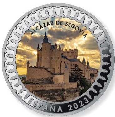
Alcazar – Segovia. XII Century Castle.