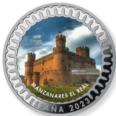
Manzanares el Real - Madrid. XIV Century Castle