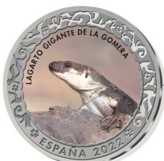
La Gomera giant lizard.