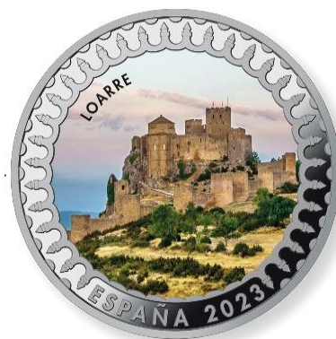
Loarre - Huesca. XI Century Castle.