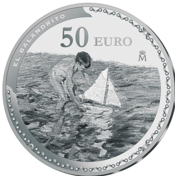
The Little Sailing Boat 1909 - Oil on canvas

This is one of the painter's most representative pieces: a scene depicting an "elegant stroll", as was commonplace on the beaches of the north, transported to the beach in Valencia. The water and beach sand come to life with long brush strokes, providing the backdrop for the figures of his wife and daughter, Maria, who walk dressed in white—Sorolla's famous white—as the breeze ruffles their dresses and headdresses. The photographic framing, which cuts off Clotilde's widebrimmed hat and leaves a strip of empty sand, brings modernity to the work.