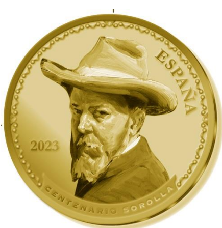
Self-portrait. 1909. Oil on canvas

The year 2023 is the centenary of his death so the Fabrica Nacional de Moneda y Timbre will release a serie of three coins, one in gold and two in silver.