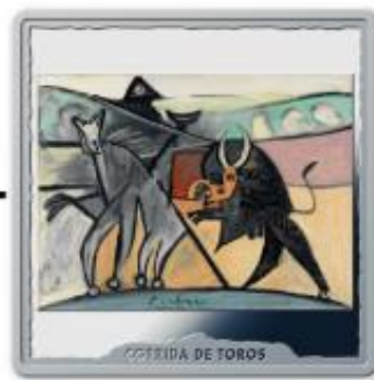
THYSSEN BORNEMISZA MUSEUM - MADRID