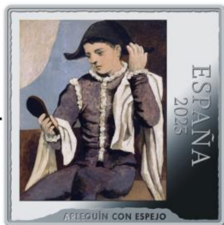
M.N.C.A REINA SOFÍA

For the square coins (60x60 - 135 g) the masterpieces showed are "Harlequin with a Mirror" and "Woman with Arms Raised"