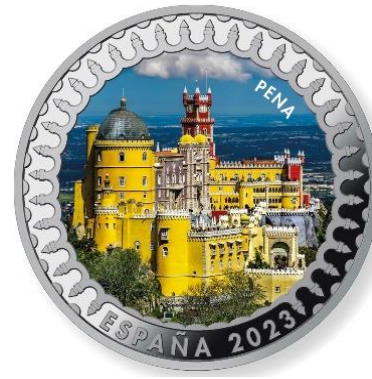
Pena – Portugal. XII, XIV Monastery and Palace