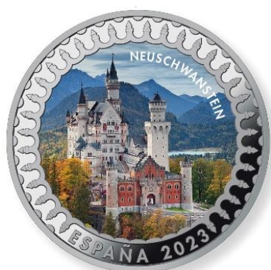
Neuschwanstein - Germany. XIX Century Castle