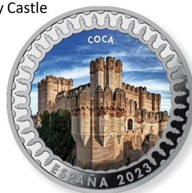
Coca – Segovia. XV Century Castle.